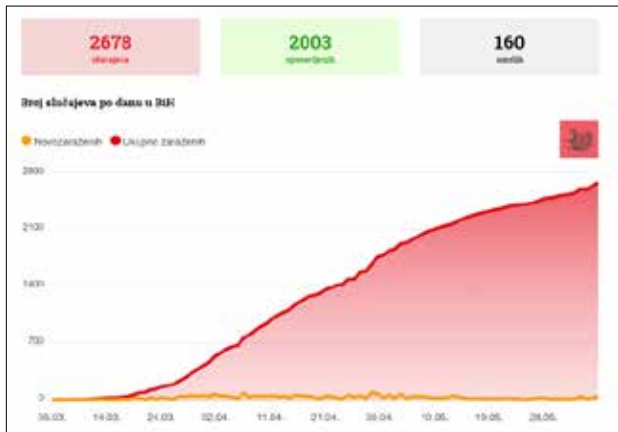
Figure 1. COVID-19 morbidity and mortality rate in B&H, June 6th, 2020 that man seeks to achieve in this world, and by „natural life“ they mean the eternal survival of the soul in lasting satisfaction, which is achieved by means of the science it had acquired and by removing ignorance. That is why the wise Plato (428-348) bespeak to the one who seeks wisdom, telling him „die according to your will, to live spiritually (by nature)“...

Death is a term that completes the definition of man. Namely, man is a living being, who thinks and dies. Therefore, the notion of death completes its essence and perfects it, and with its help it rises to its highest spheres (where reason prevails). Therefore, the one who fears death in this manner, truly does not know of what it should be feared of, and fears of what from which there is no fear of and what has no effect.